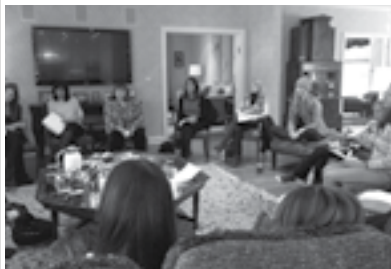
JAC’s 4th Annual Power of Women Luncheon is in full swing. Our planning committee met this month to begin work on another stellar event!