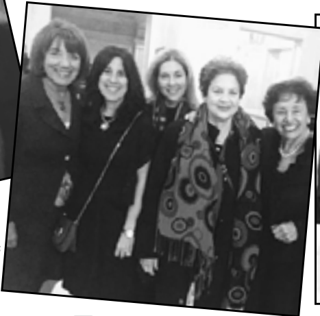
JAC members with Reps. Susan Davis (CA-53), Lois Frankel (FL-22), and Nita Lowey (NY-17)